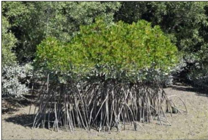
Figure 1. Mangroves ( Rhizophora sp.)

various mangrove communities to understand their spatial distribution and ecological importance. More importantly, the emphasis is on exploiting the spectral signature captured by multiple sensors in various domains of electromagnetic spectrum to map the spatial distribution of mangroves. For example, Kumar et al. (2017) employed the signatures of mangrove communities captured by RISAT-1 and Resourcesat-2 LISS-IV satellite sensors to improve mangrove community discrimination in the Marine National Park and Sanctuary (MNP&S), Gulf of Kachchh, Gujarat, India. These authors found that merging the signatures captured in microwave domain of electro-magnetic spectrum by RISAT-1 (Radar Imaging Satellite-1) and those captured by LISS-IV (Linear Imaging Self-Scanning-IV) sensors did improve the classification of mangrove communities.